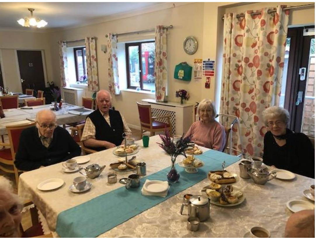
We all had a lovely time at our monthly coffee morning, please feel free to join us on the last Thursday of every month.